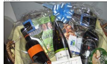
Classic Wine Lover's Basket